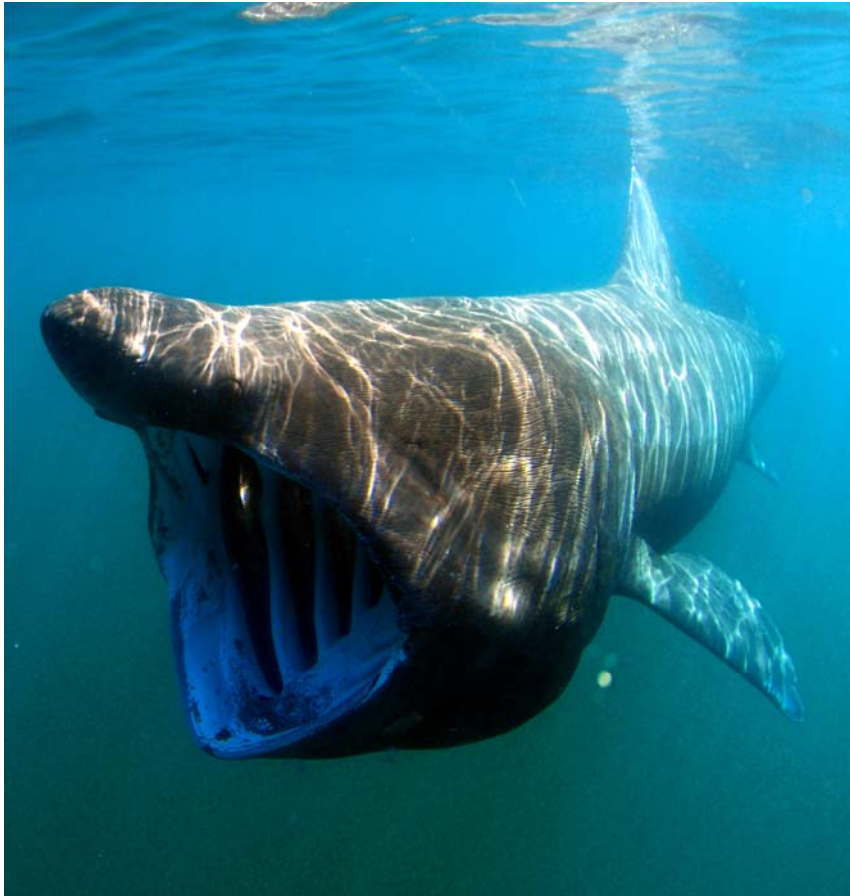
The Basking Shark