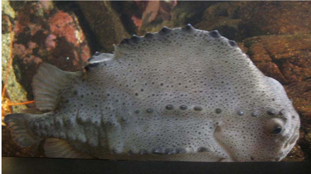
Lumpsuckers or lumpfish